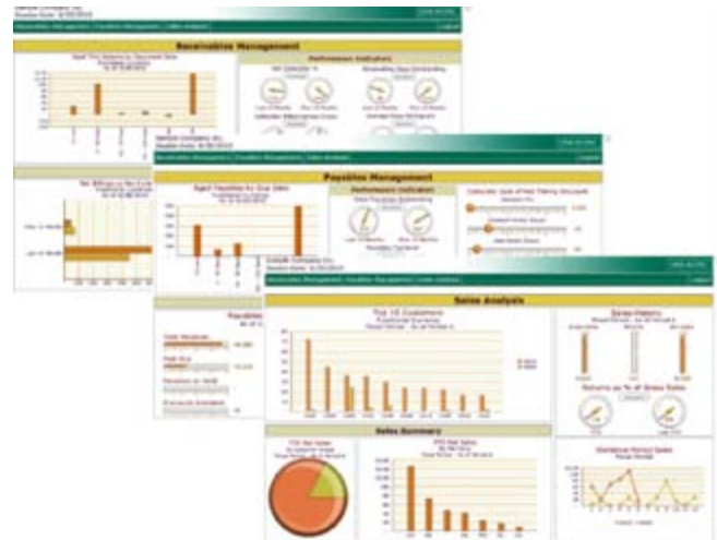
Accounts Payable, receivable and Sales Analysis dashboards